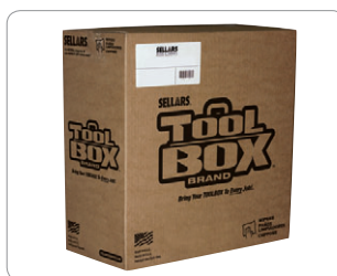
Z300 Interfold Outer Case

*WYPALL is a registered trademark of Kimberly-Clark Worldwide Inc.